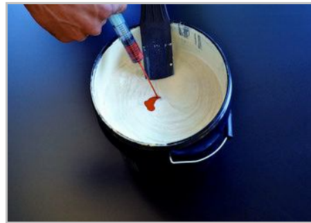
Step 2 - Prepare the shade with Casa dei Sogni