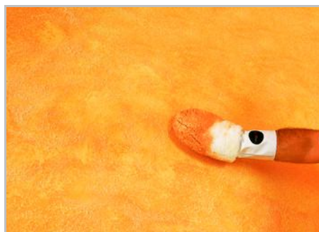
Step 6 - Second coat, optional if you want an 'aging effect' to the wall, pass again after 15-30 minutes with the glove dampened with the product