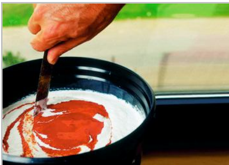
Step 3 - Mix the product until it's homogeneous