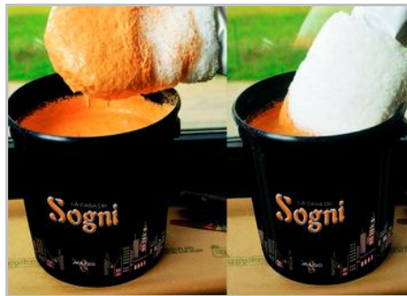
Step 4 - La Casa dei Sogni: profusely wet the surface. Trasparenze: slightly wet the surface