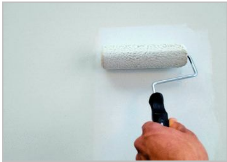
Step 1 - To start, apply Primus Sabbia

Conservation: in a dry, cool place, away from the frost and humidity.